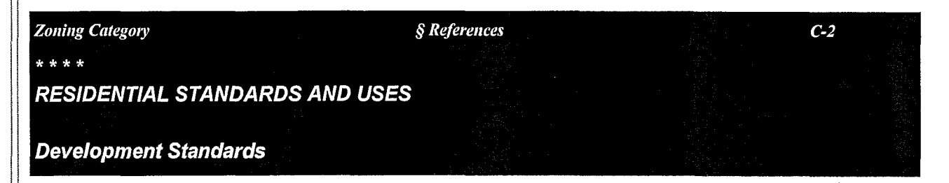
Table 210.1 ZONING CONTROL TABLE FOR C-2 DISTRICTS