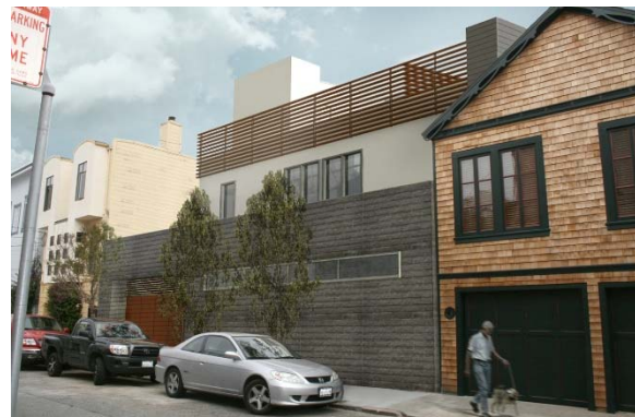
SE Pixley Street

Design services are being provided by Public Works BDC/IDC and as-needed civil engineering and electrical consultants. Site permit was issued on February 12, 2015. Construction