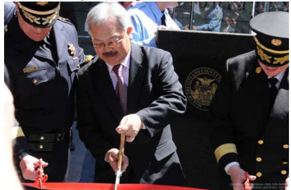
Grand Opening April 16, 2015