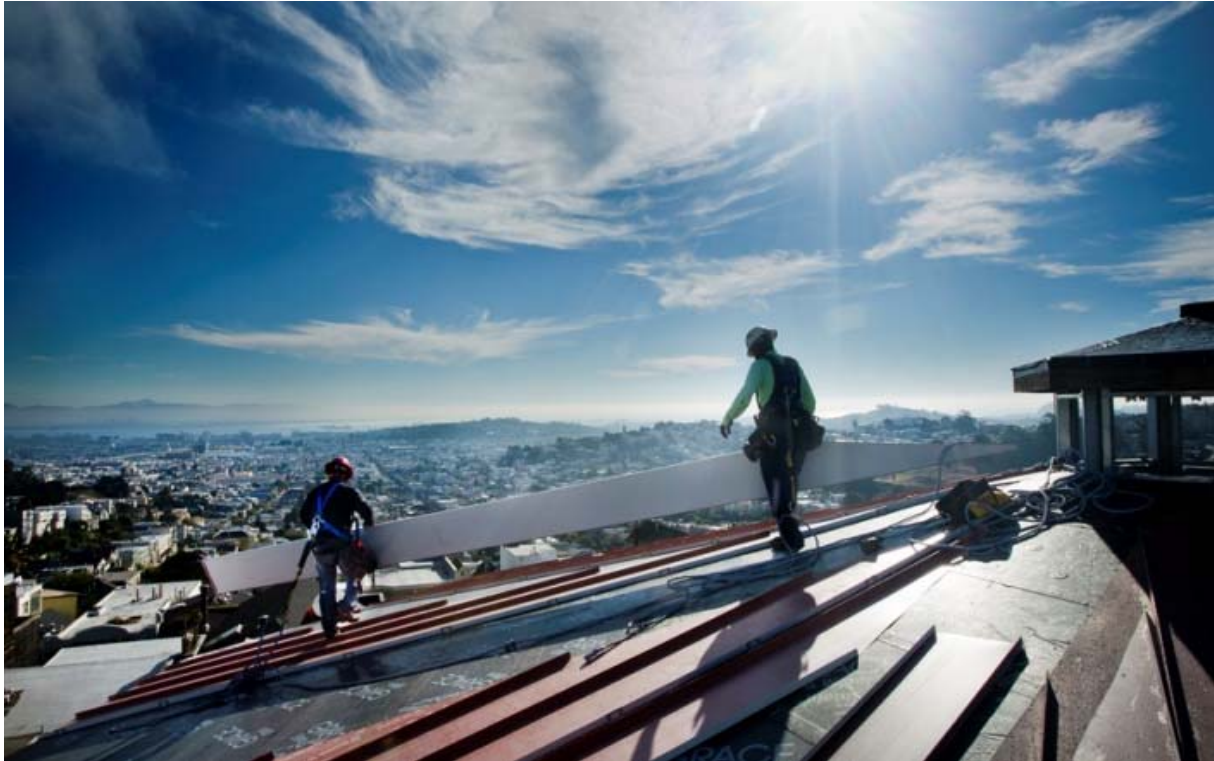
AWSS: New architectural roof over Ashbury Heights Tank

Program Background: The Emergency Firefighting Water System delivers high-pressure water and provides cistern water storage for fire suppression in several areas of the City. The Emergency Firefighting Water System is vital for protecting against the loss of life, homes, and businesses from fire following an earthquake. It is also used for the suppression of non-earthquake multiple-alarm fires.