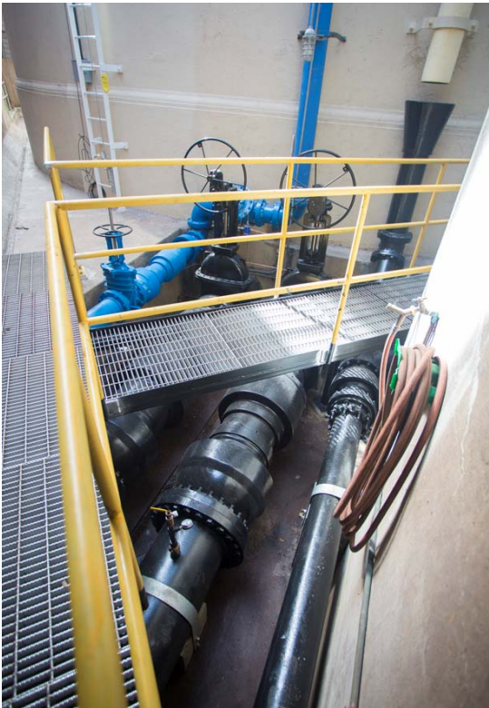
Jones Street Tank, new piping and walkway