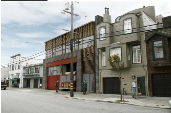
NW Greenwich Street