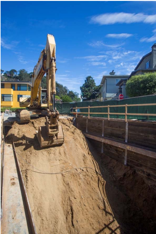
Dorchester Way & Ulloa Street cistern