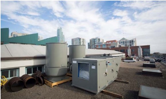
Pumping Station 1, new ventilation equipment with new engine exhausts in background