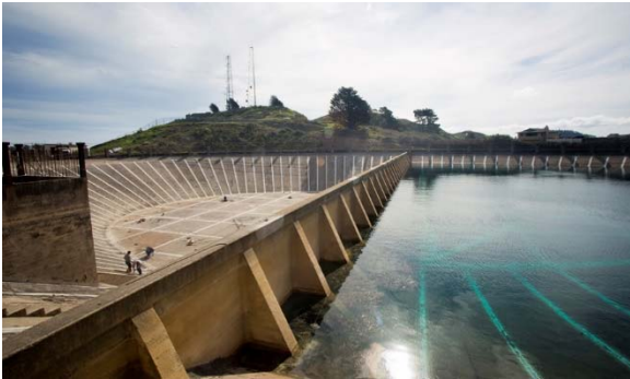
Twin Peaks Reservoir Joint Sealant