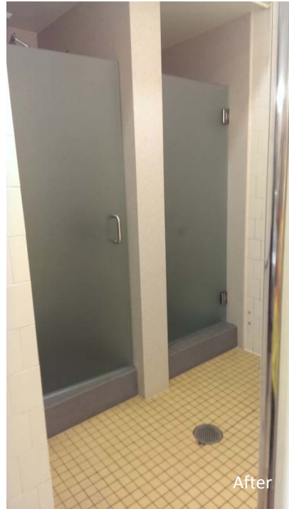
7432A Showers – Package 3 Station 26

Project reached substantial completion in September and final completion is expected in October per latest approved schedule. Close out process, including the preparation of construction documents, is underway.