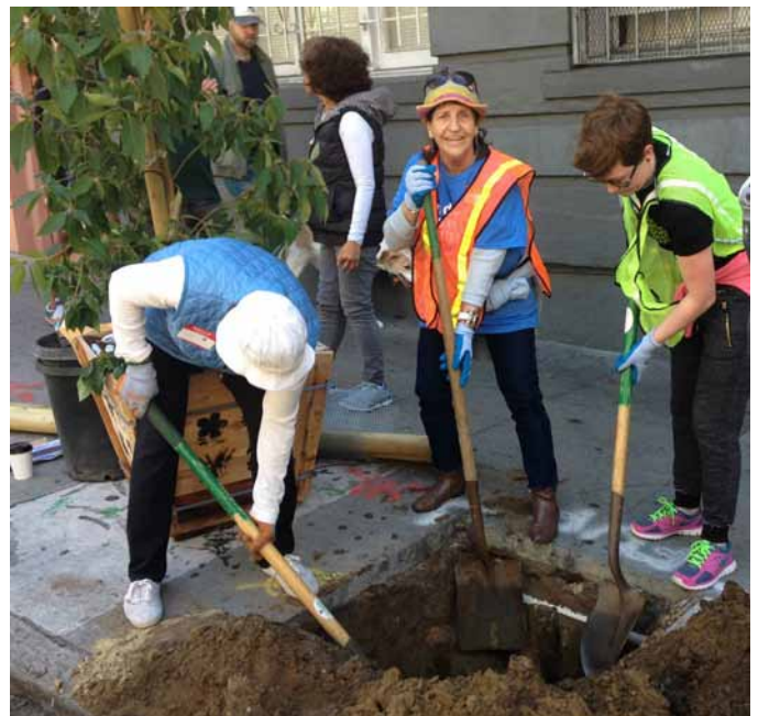
Board member and volunteers at June 13th, 2015 Tenderloin community tree planting campaign

In 2015, the TLCBD funded SF Clean City for the purchase of a new sturdy flat bed truck and hot water pressure washing equipment. The new equipment began work in the District this summer.