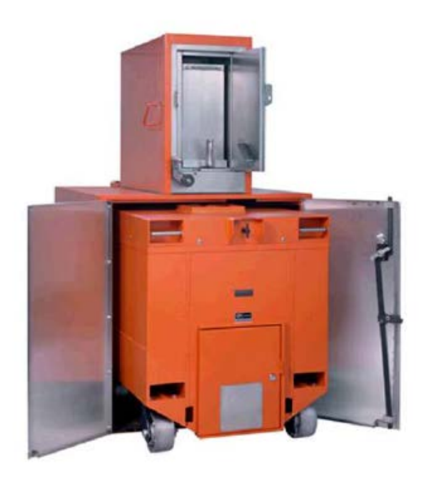
Figure A-5: Revenue Transfer and Collection System Components, including a Cashbox Receiver (top), Mobile Bin (bottom, on wheels) and Vault Housing (container with doors)