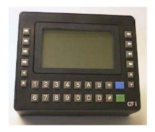
Figure A-2: Operator Control Unit

The OCU dimensions shall be no greater than 8 inches by 7 inches by 3 inches.