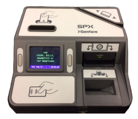
Figure A-1: Odyssey Farebox with color passenger display

The Contractor shall install its Odyssey model Farebox on all Muni trolley coach, motor coach, light rail vehicles and most historic streetcars. Historic streetcars with antique fareboxes and cable cars are not included in this procurement. As shown in Figure A.1, the Odyssey Farebox will include a color passenger display, slots for coin and bill currency, a transfer/fare receipt dispenser and a transfer/fare receipt reader.