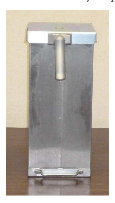
Figure A-4: Cashbox

(1) To store revenues securely, each Farebox shall contain a Cashbox as shown in Figure A-4. All U.S. coins and bills shall be deposited into a single Cashbox, securely compartmentalized to separate the coins from the bills.