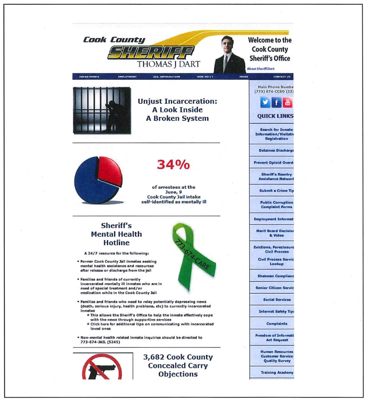
Figure 3: Cook County Illinois Sheriff's Department Home Page, Accessed June 12, 2016 Notice the page has a significant focus on assisting inmates, past and present, who need to receive mental health services.

The Jury also noted that Open Data SF is an initiative of the City to be more transparent in its operations. Since the Sheriff's Department already prepares data on jail population, daily bookings and releases, demographics, recidivism, inspection reports, operating costs, spending per inmate and a number of other variables, we believe that the public would be served by including this data on the website.