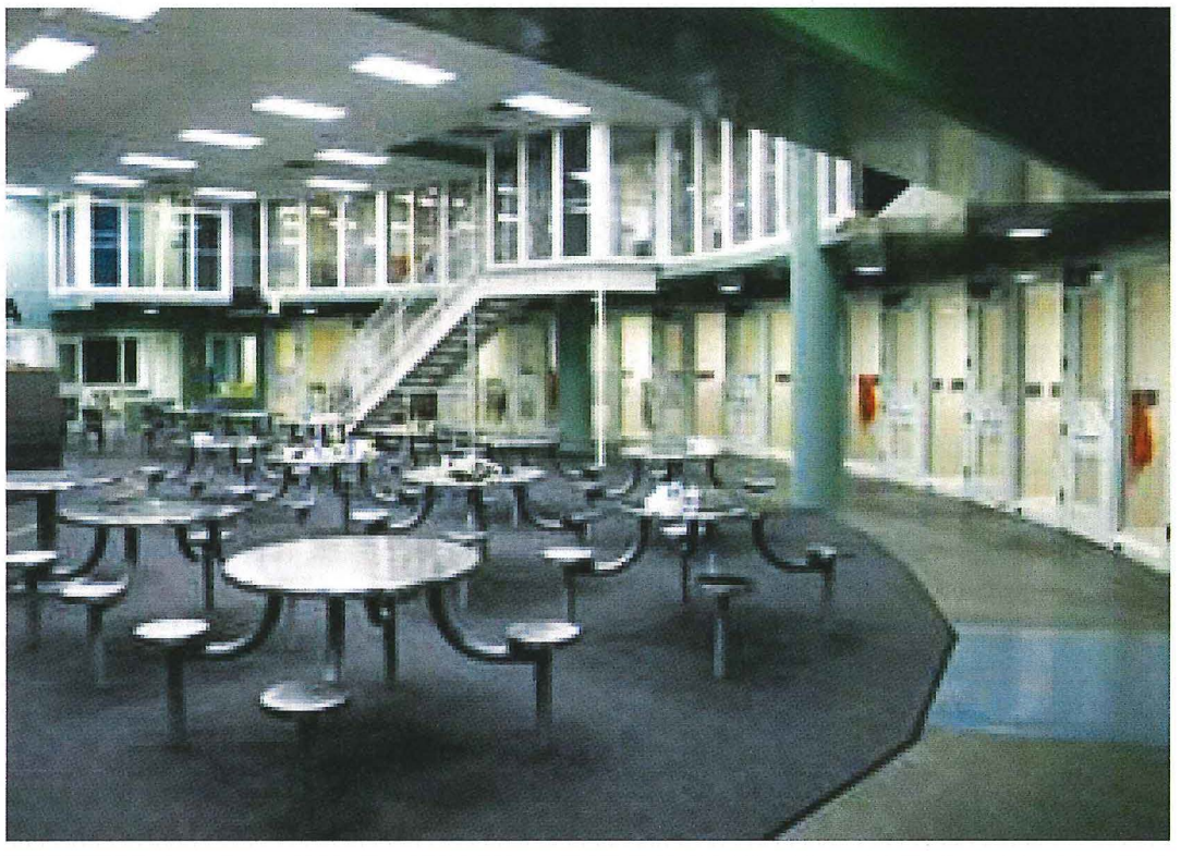
Figure 1: Two Housing Styles in SF County Jails - linear (upper) and pod (lower) design