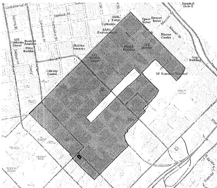
Map of the Interim Controls: The Interim Controls apply to the Transit Center District Plan Area, except for within City Park and those portion of the Plan Area that overlap with the area defined as Zone One of the Transbay Redevelopment Plan, which portions consist of certain land within the boundaries of Spear, Mission, Folsom and Second Streets.