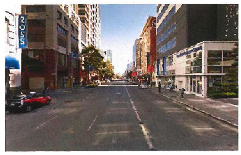
10 4th St San Francisco, CA 94103