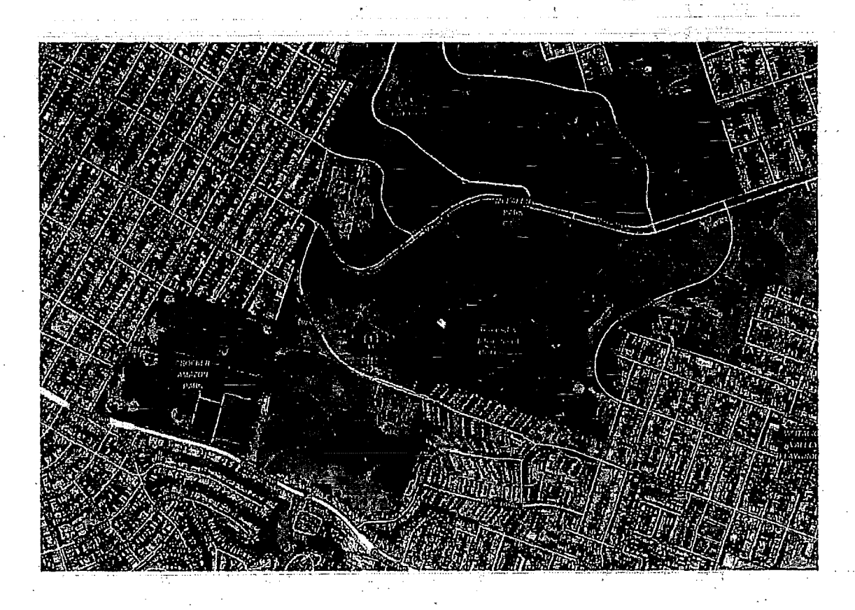
EXHIBIT A: PROJECT LOCATION