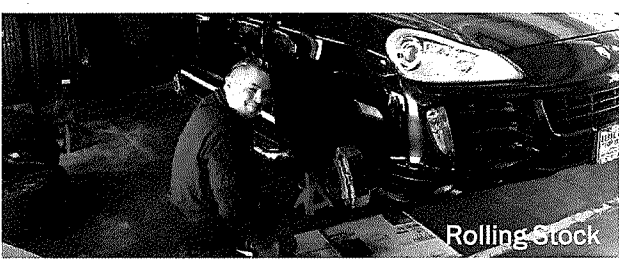
Production, Distribution and Repair (PDR)