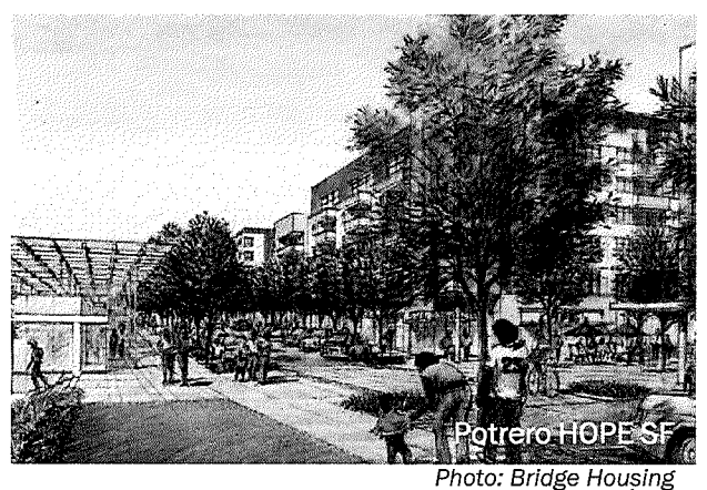
Development Agreement Implementation