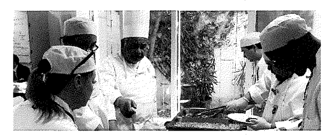
Hospitality Sector Academy