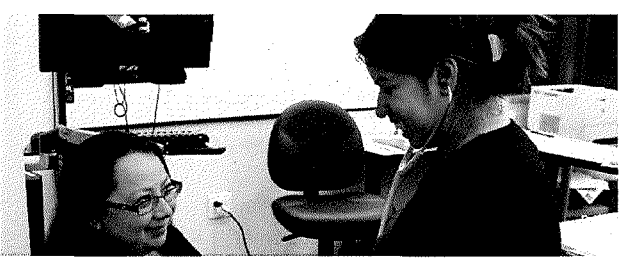
Health Care Sector Academy