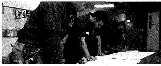
Chapter 30 Alignment