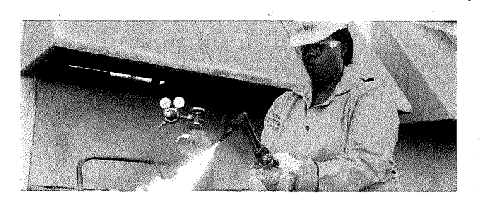
CityBuild Sector Academy