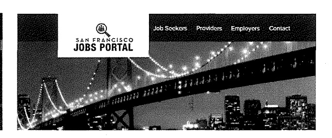
San Francisco Jobs Portal