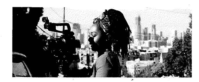
TechSF Sector Academy