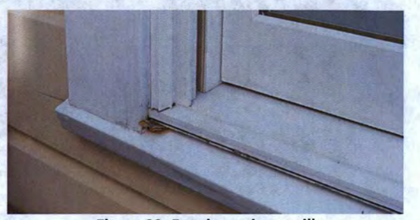
Figure 20: Fungi growing at sill