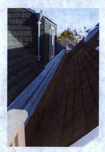
Figure 13: West roof gutter. Note water ponding locations

Skylight Condition: Fair/Poor. The east acrylic lite is cracked. The wood trim at the curb is weathered, checked with raised grain. Mastic waterproofing is applied at the curb to roof interface.