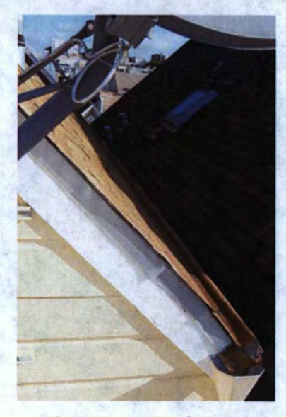
Figure 14: East roof gutter.