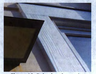
Figure 19: Raised grain at trim

Wood Trim and Sill Condition: Good to Fair. Some raised grain and paint failure is present (Figure 19). Organic growth was observed at one rear west façade window (Figure 20).