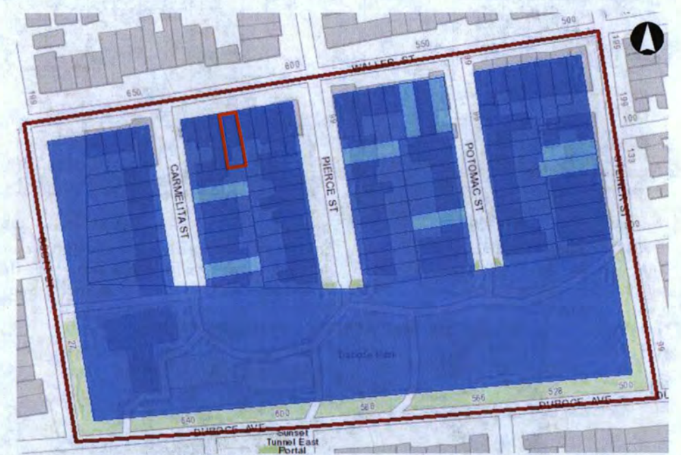
Figure 5: Duboce Park Landmark District. Subject property indicated with orange rectangle. Properties shaded darker blue are contributors, cyan shaded parcels are non-contributors

627 Waller St. is located within the Duboce Park Landmark District (Historic District) (Figure 5). The Historic District was initially determined eligible for designation to the National Register under Criterion C (Architecture) as result of the San Francisco Planning Department's Market and Octavia Area Plan Survey (Market Octavia Survey). As of July 12, 2013, the Duboce Park Landmark District was designated by the City and County of San Francisco.<sup>6</sup> The Market Octavia Survey found the district contained a "group of properties that embody the distinctive characteristics of a type, period or method of construction, and that possess high artistic values," with a Period of Significance spanning 1896-1913, and an identified Theme of Neighborhood Development.<sup>7</sup> 627 Waller is one of 80 contributing properties located within the Historic District. Contributing properties are considered representative of "a noteworthy grouping of turn-of-the-century buildings exhibiting late-Victorian and Edwardian era styles characteristic of San Francisco. Common [architectural] traits found throughout the district include: bay windows, decorative cornices, ornamental shingles, and spindle work, as well as more Classically-influenced detailing such as dentils, pediments, columns, and applied plaster ornament.