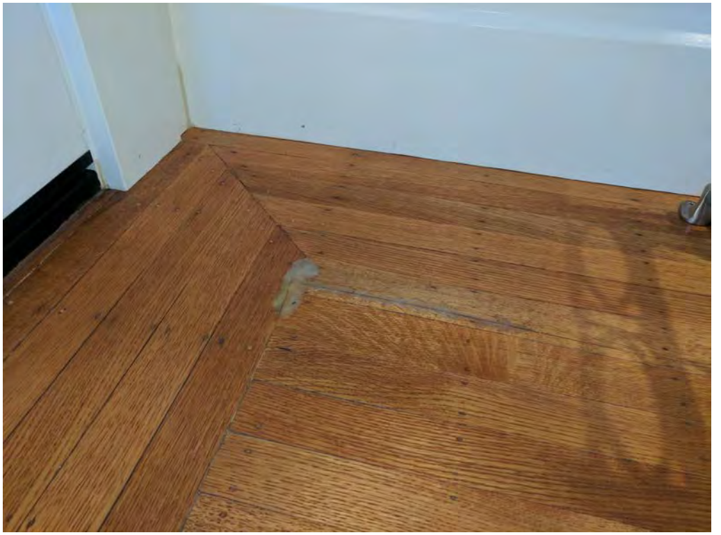
Scope 2: Rear of House Photo A: Bedroom floor warping (sealed with wax)