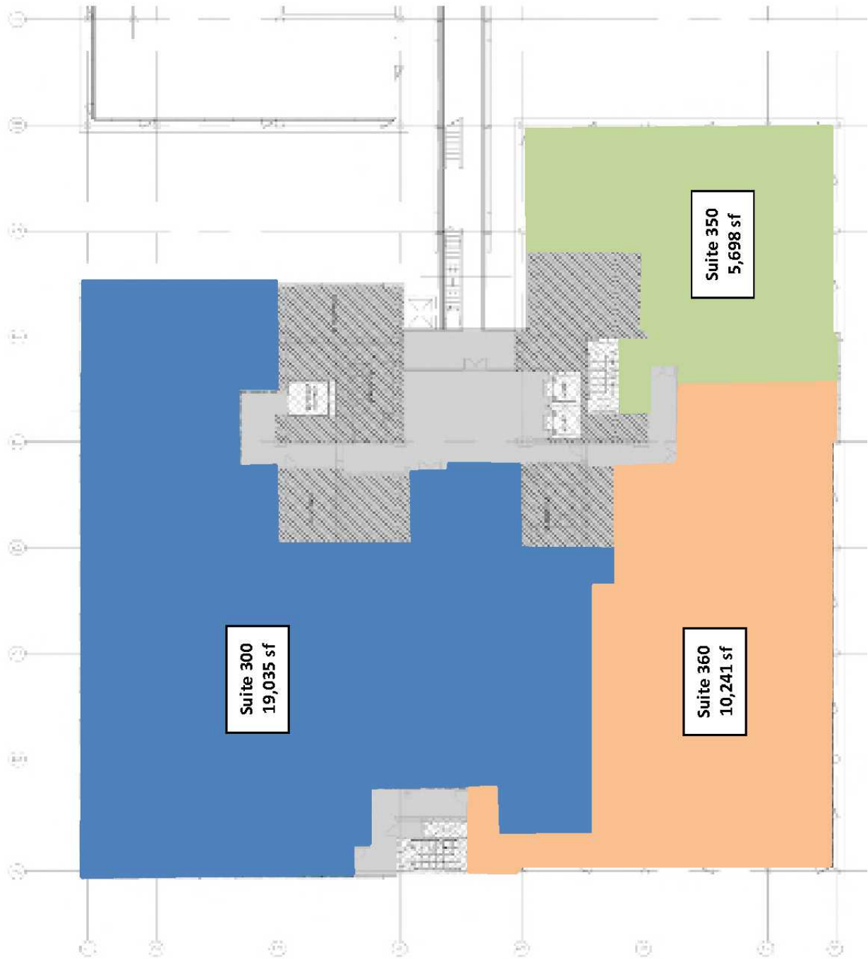
Exhibit A - 3