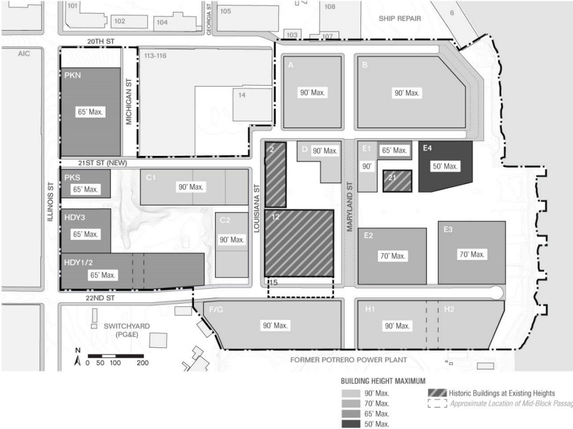
Figure 2: Building Heights Maximum.

(2) Measurement of Height. Measurement of Height shall be governed by the controls set forth in Section 6.4 of the Design for Development (Maximum Building Height) and not as provided in Section 260.