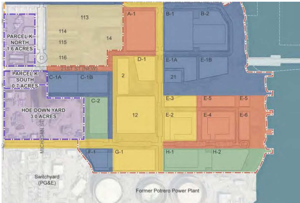
Exhibit 1: Hoedown Yard Site

The Infrastructure Financing Plan assumes that the Hoedown Yard will be developed with 367 condominium units, within 384,365 gross building square feet, which will generate property tax increment revenue under the IRFD to fund affordable housing development on the Waterfront Site and Parcel K South. Because affordable housing will not be developed on the Hoedown Yard site, the condominiums will also be assessed a 28 percent in-lieu fee payable to the Mayor's Office and Housing and Community Development (MOHCD) for development of affordable housing outside of the Pier 70 Special Use District.