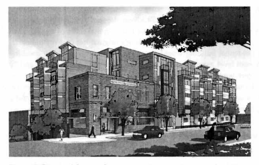
Figure 2: Proposed Project Design