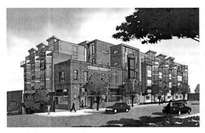
Figure 2: Proposed Project Design