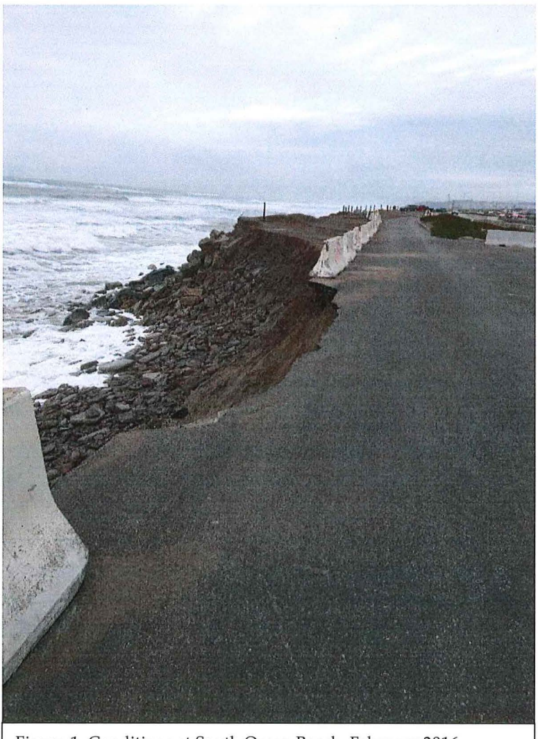
Figure 1. Conditions at South Ocean Beach, February 2016.

south Ocean Beach has damaged the Great Highway, resulted in the loss of beach parking, and threatens to damage critical wastewater system infrastructure. See Figures 1 and 2 for current shoreline conditions and erosion at South Ocean Beach. Sea level rise and the increased frequency and severity of coastal storms anticipated due to global climate change will likely exacerbate these effects in the decades to come.