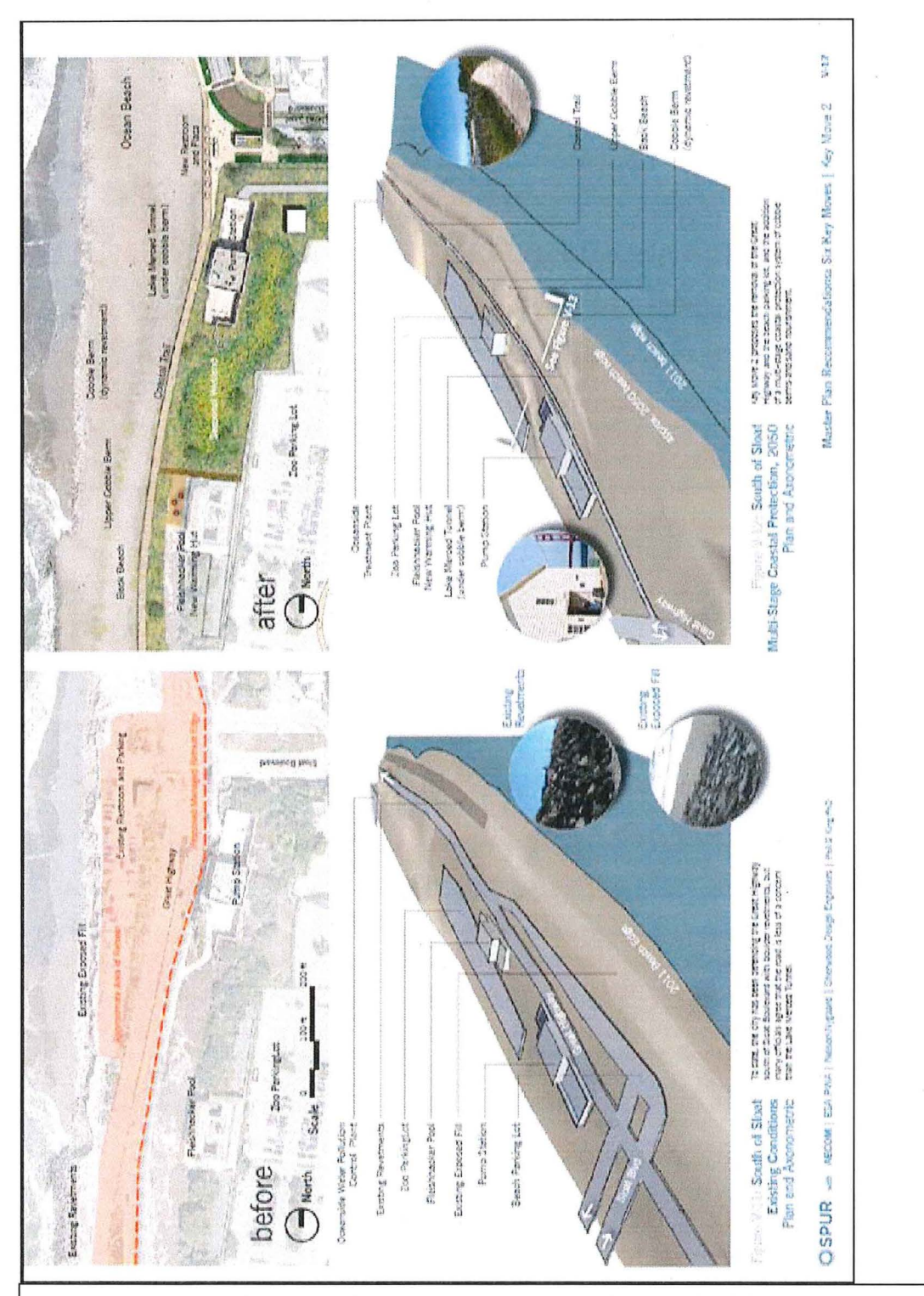
Figure 3. Ocean Beach Master Plan Key Move 2, proposed removal of the Great Highway and parking lots between Sloat Boulevard and Skyline Drive with low profile protection for the Lake Merced Tunnel and other wastewater infrastructure. Graphic Credit: SPUR, 2012.