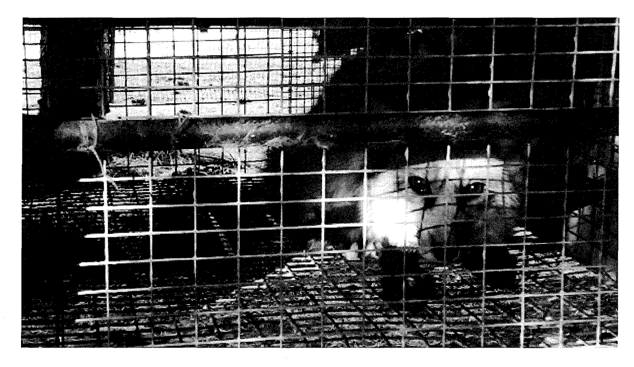
Animals exploited by the fur industry are routinely bludgeoned, hanged, stabbed, gassed, electrocuted, and sometimes skinned alive.

Right now, San Francisco is considering banning the sale of fur! This would make it the first major city in the U.S. to make this groundbreaking, compassionate choice.