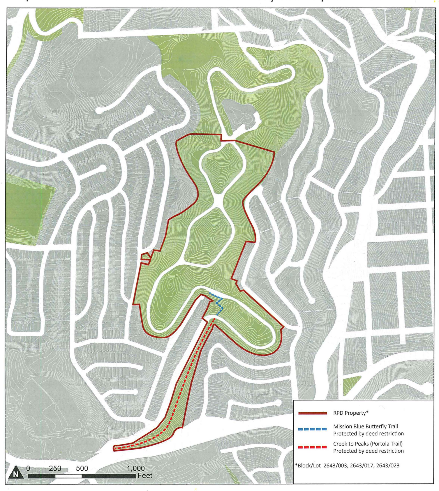
Exhibit A Legal Description of Property (page 1 of 2) Project No. HT-38-003 Creeks-to-Peaks Trail System Improvement