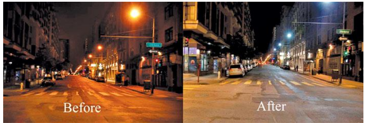
Example of Night Safety Issue Before and After Changes:

Currently, San Francisco is going through a transition with replacing the current high pressure sodium lights to light-emitting diode (LED) lighting but at a very slow rate. As of June 2015, there was a recorded 465 LED lights spread across the city while there is about 46,000 lights total in the City. That is about 1% of lights changed to LED lighting over the span of 3 years. The high pressure sodium lights have a life span of 3-5 years while the LED lights have a life span of 15-20 years. Also the low lighting and/or broken fixtures cause numerous pedestrian safety issues. Two issues that stem from low lighting and broken fixtures are loitering and stalking. These issues already happen more at night, and low to no lighting only helps those continue to do so.