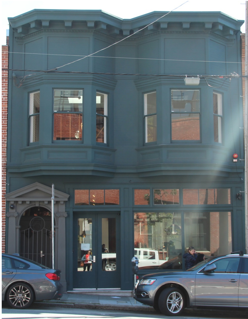
457 BRYANT STREET Pile Drivers, Bridge and Structural Ironworkers Local No. 77 Union Hall