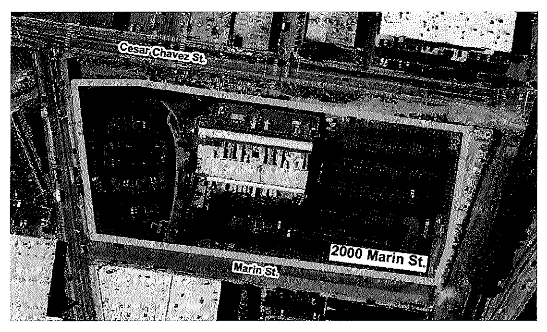
Exhibit 2: 2000 Marin Street