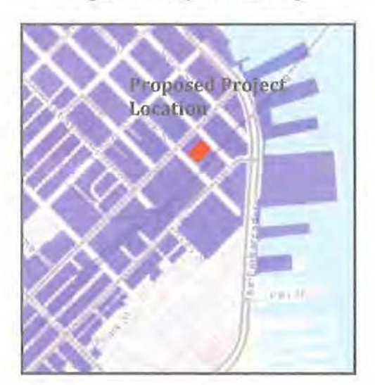
Figure 1. Project Area Map

The proposed Project is in an area of extreme poor air quality and high risk for human health problems due to its proximity to I-80 and population density, which is subject to Article 38 of the San Francisco Health Code<sup>4</sup>. The City and County of San Francisco established Article 38 because scientific studies consistently showed an association between exposure to air pollution and significant human health problems. In 2008, Article 38 was adopted to require new residential construction projects located in areas of poor air quality and pollution from roadways must install enhanced ventilation to protect residents from the respiratory, heart, and other health effects of living in a poor air quality area. The law was updated in 2014 to improve consistency with California Environmental Quality Act (CEQA) and streamline implementation. The 2014 amendments included revisions to the underlying map of the city's APEZ --the end result of a collaborative effort with the Bay Area Air Quality Management District. The amendments codify the implementation strategy that was formalized in July 2013, when the Air Quality Program began providing several options for determining compliance with Article 38.