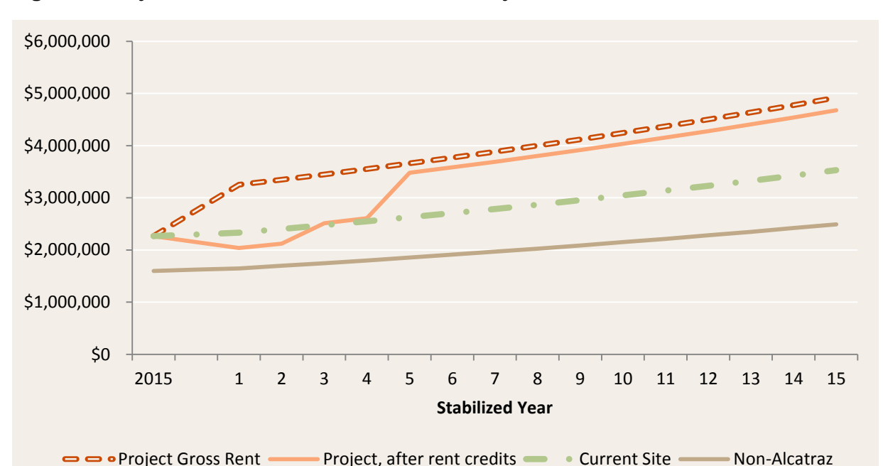
Figure 3. Project vs. Illustrative Alternatives - Projected Revenue to Port

Figure 4 provides this similar comparison in net present terms (calculated for 30 years with a 6 percent discount rate). The net present value (NPV) of: Project revenues to the Port total $53 million (after rent credit deductions); Current site revenues are estimated at $43 million in NPV; and Non-Alcatraz NPV of revenues total $26 million.