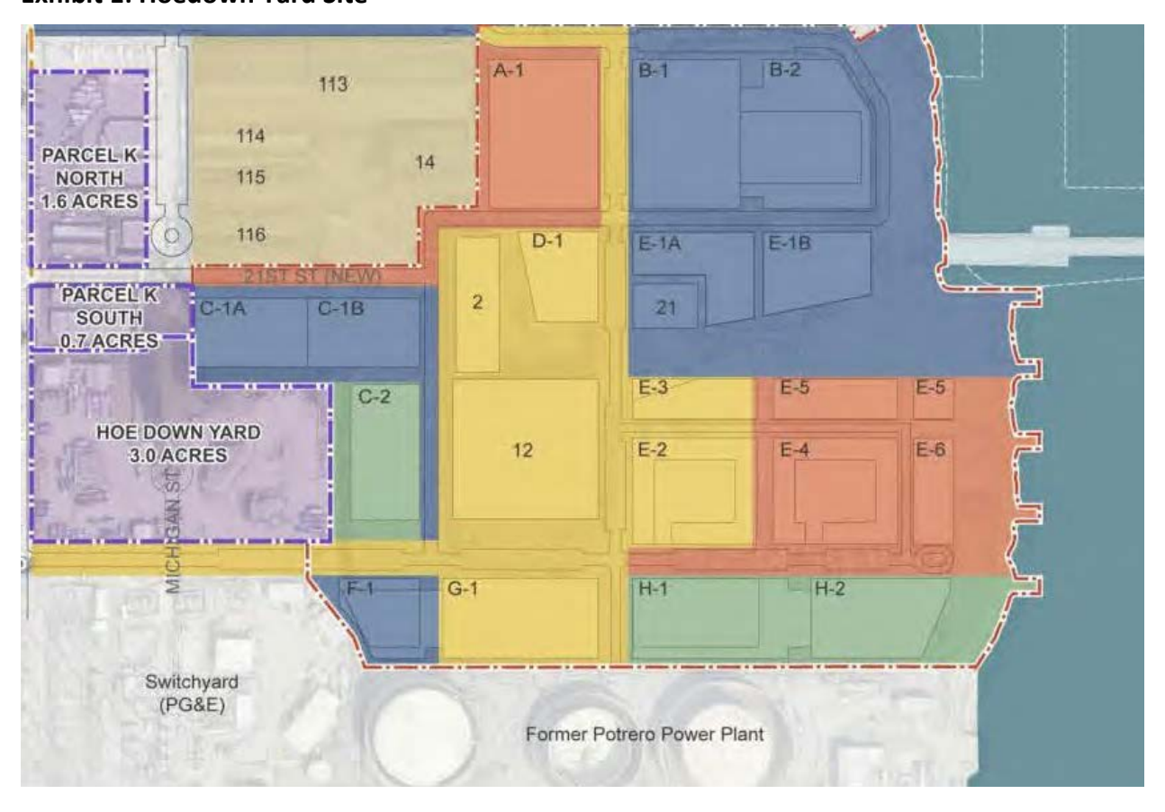
Exhibit 1: Hoedown Yard Site

The Infrastructure Financing Plan assumes that the Hoedown Yard will be developed with 330 condominium units, within 349,353 gross building square feet, which will generate property tax increment revenue under the IRFD to fund affordable housing development on the Waterfront Site and Parcel K South. Because affordable housing will not be developed on the Hoedown Yard site, the condominiums will also be assessed a 28 percent in-lieu fee payable to the Mayor's Office and Housing and Community Development (MOHCD) for development of affordable housing outside of the Pier 70 Special Use District.