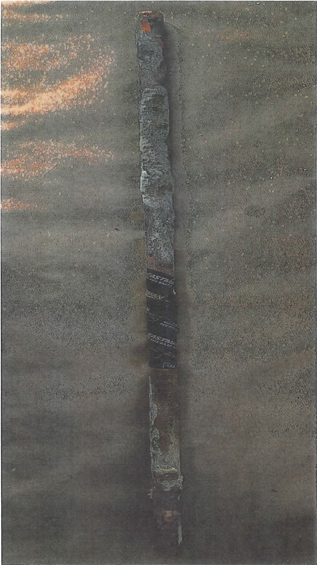
A copper water pipe from the subject area Influenced by salt water and lead contamination