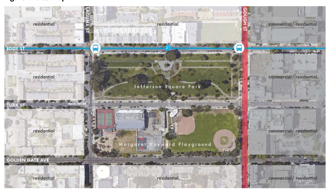
Figure 1. Site Map

The proposed modification to the property will: