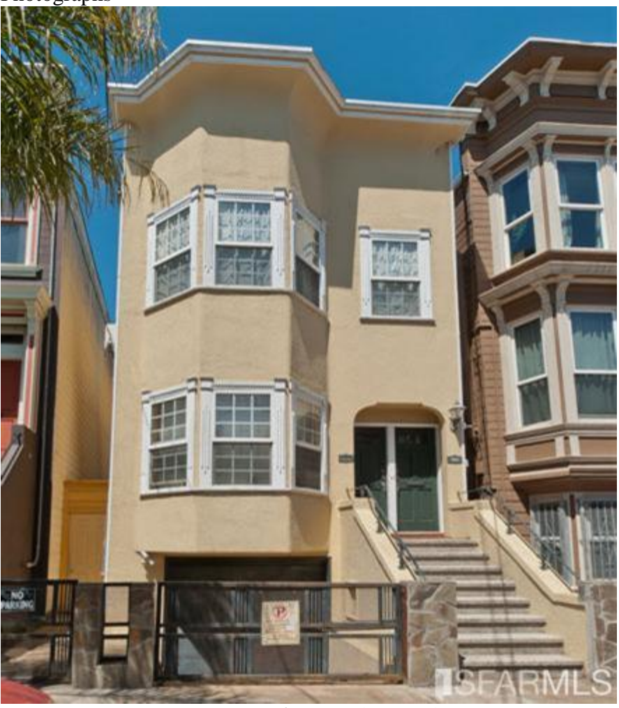
Figure 1. Before image of 354-356 San Carlos St. taken in 2012. Front facade view looking east.