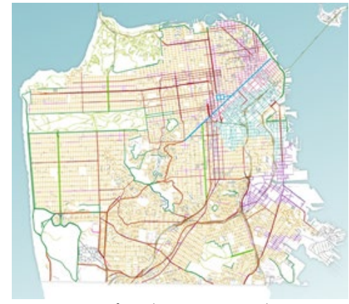
Street Type Map from the Better Streets Plan

Under the Better Streets Plan, street types are defined by the contextual zoning on a given block. The plan recommends 15-foot sidewalk widths for high-intensity street types like Downtown Residential Streets and Neighborhood Commercial Streets.