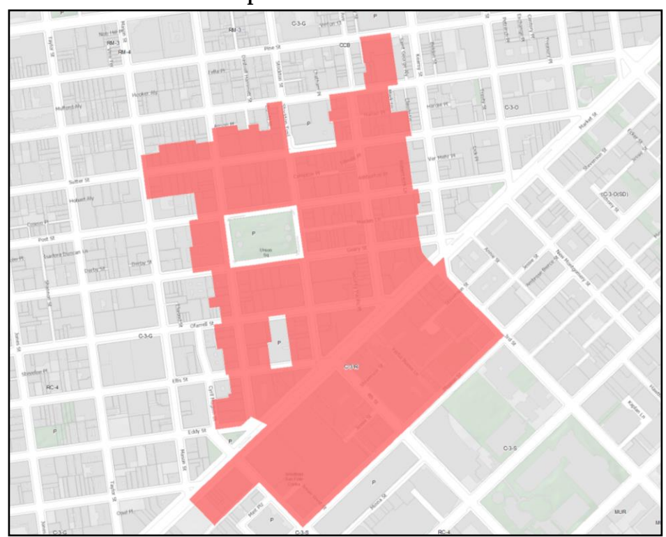
Map of the C-3-R District

In March of 2017, OEWD and the Planning Department reported to the Planning Commission on the trends in the C-3-R District compared to local, regional, and national trends. At that hearing, the Planning Department recommended three approaches for reviewing retail to office conversions in the C-3-R District: 1) Continuing to review projects seeking upper level retail-to-office conversions on a case-by-case basis through the CU authorization process; 2) Adopting a policy that provides specific additional criteria that such projects must meet in order for approval, or; 3) Initiate changes to the Code to codify the criteria that projects in the C-3-R must meet in order to be approved. After the initial hearing, OEWD conducted additional analysis which it presented to the Planning Commission in February 2018, at a second informational hearing about C3R retail to office conversion policy, and found that union Square lease rates have surpassed Citywide lease rates, and that Union Square has higher lease rates than any part of the City in all classes of office.