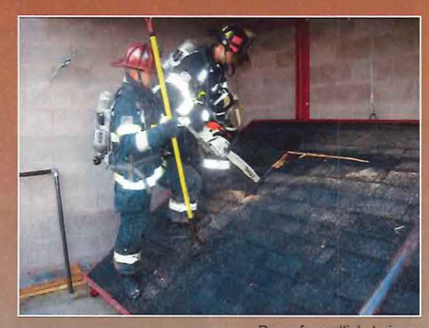
Room for multiple trainees