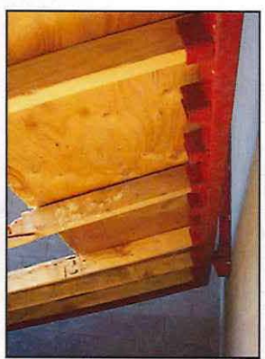
Easy access to replace rafters.