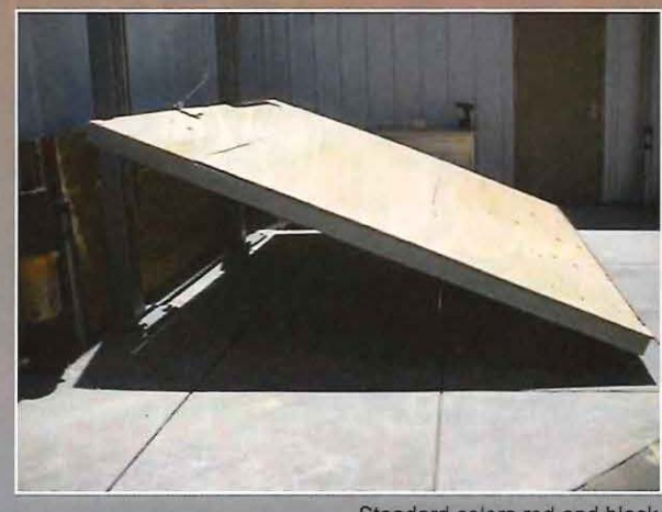
Standard colors red and black