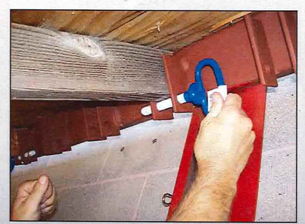
Easy pull pins make rafter replacement easy.

The ventilation roof prop is designed to allow your department to conduct realistic training scenarios and simulations.