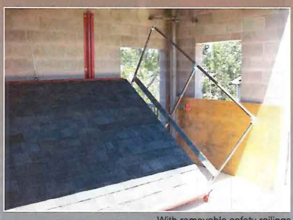
With removable safety railings

The ventilation roof prop is designed to allow your department to conduct realistic training scenarios and simulations.