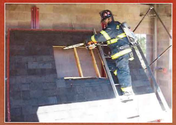
Adjustable roof pitch