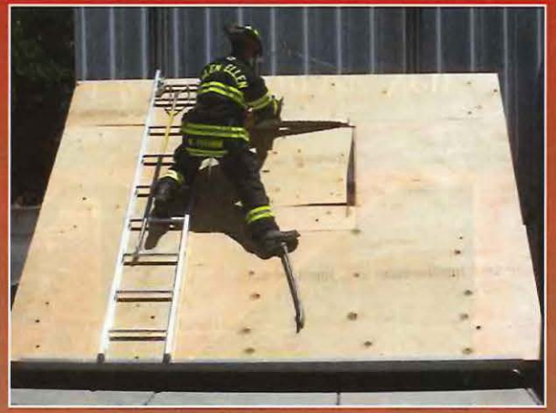
Can be used with or without roof ladder