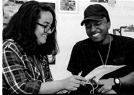
Clients of Larkin Street Youth Services

With expanded services, more families will be more likely to recover from the traumatic impacts of homelessness.