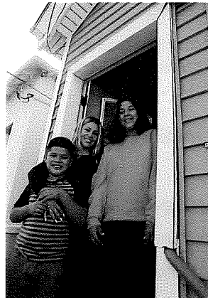
Clients of Homeless Prenatal Program

Need-Based Subsidies for Families Need-based subsidies fill a critical gap for families who are not able to increase their income in a short period of time and those who cannot move outside of San Francisco, including families with special needs children or chronic health conditions.