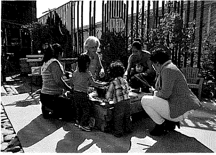
Clients of Homeless Prenatal Program