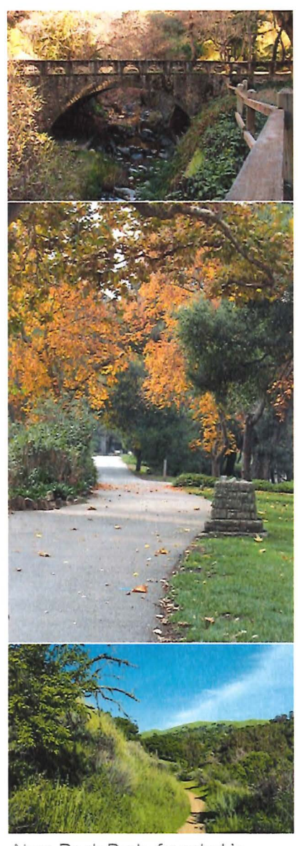
Alum Rock Park, founded in 1872, is California's oldest municipal park.

There were 3,863 housing units at an average density of 3,207.3 per square mile (1,238.4/km²), of which 2,393 (64.9%) were owner-occupied, and 1,293 (35.1%) were occupied by renters. The homeowner vacancy rate was 1.8%; the rental vacancy rate was 3.2%. 9,541 people (61.4% of the population) lived in owner-occupied housing units and 5,823 people (37.5%) lived in rental housing units.