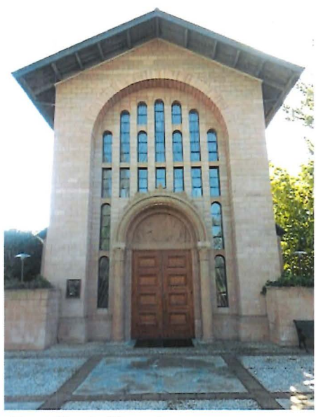
Alum Rock Chapel.

As of the <u>census<sup>[9]</sup></u> of 2000, there were 13,479 people, 3,345 households, and 2,736 families residing in the CDP. The population density was 12,044.7