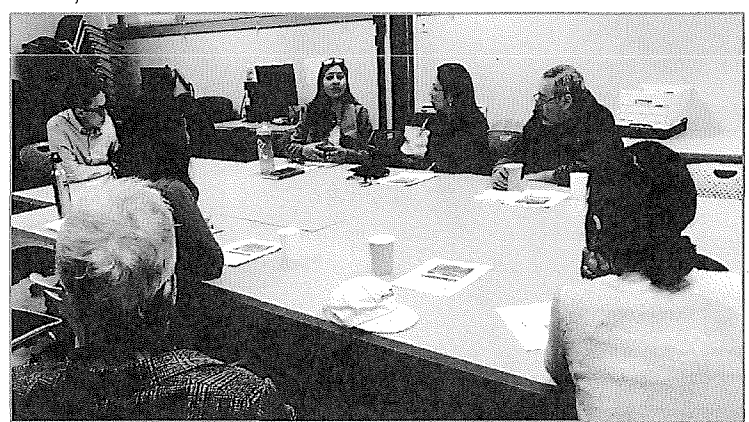
CPP Meeting at Sunset Mental Health Program.

findings to suit diverse audiences. San Francisco also has an active Mental Health Board that meets monthly and a Behavioral Health Services Client Council, where issues important to client representatives, including Innovations project findings, are presented and discussed. Both the Client Council and the Mental Health Board will be integral partners in designing the evaluation, interpreting and reporting the findings, and making recommendations for client-focused program improvement.