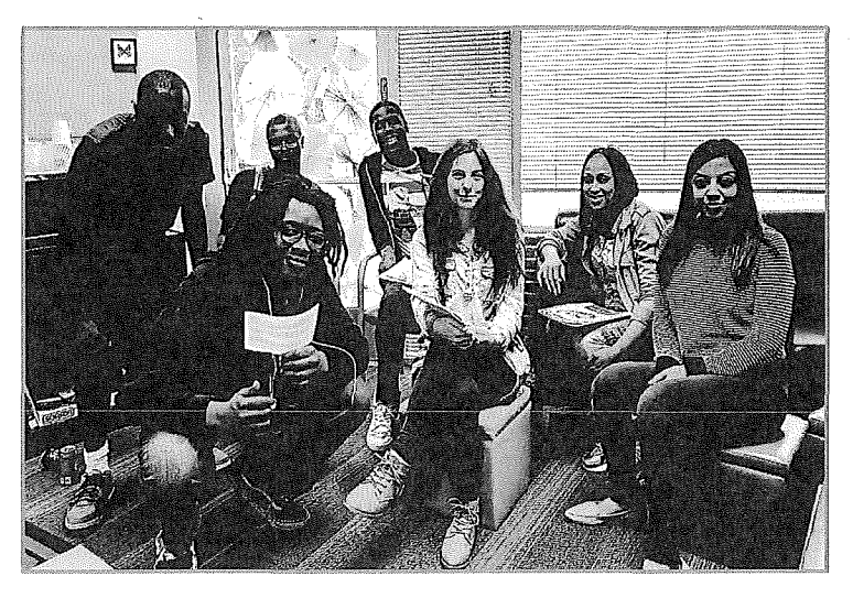
SF-MHSA Transitional Age Youth CPP activity

This project will include a 0.5 full-time equivalent manager who will oversee all aspects of this project. This manager will be in charge of all areas of implementation, staff training, community training, marketing and evaluation. This manager will also liaise with all counties participating in the collaborative effort, consult with key stakeholders, seek technical assistance from experts in the field, coordinate activities with the selected providers and ensure that all activities adhere to guidelines identified by the MHSOAC. Project staff will include 3.0 full-time equivalent local peer specialists located within the City and County of San Francisco who will assist with project planning and