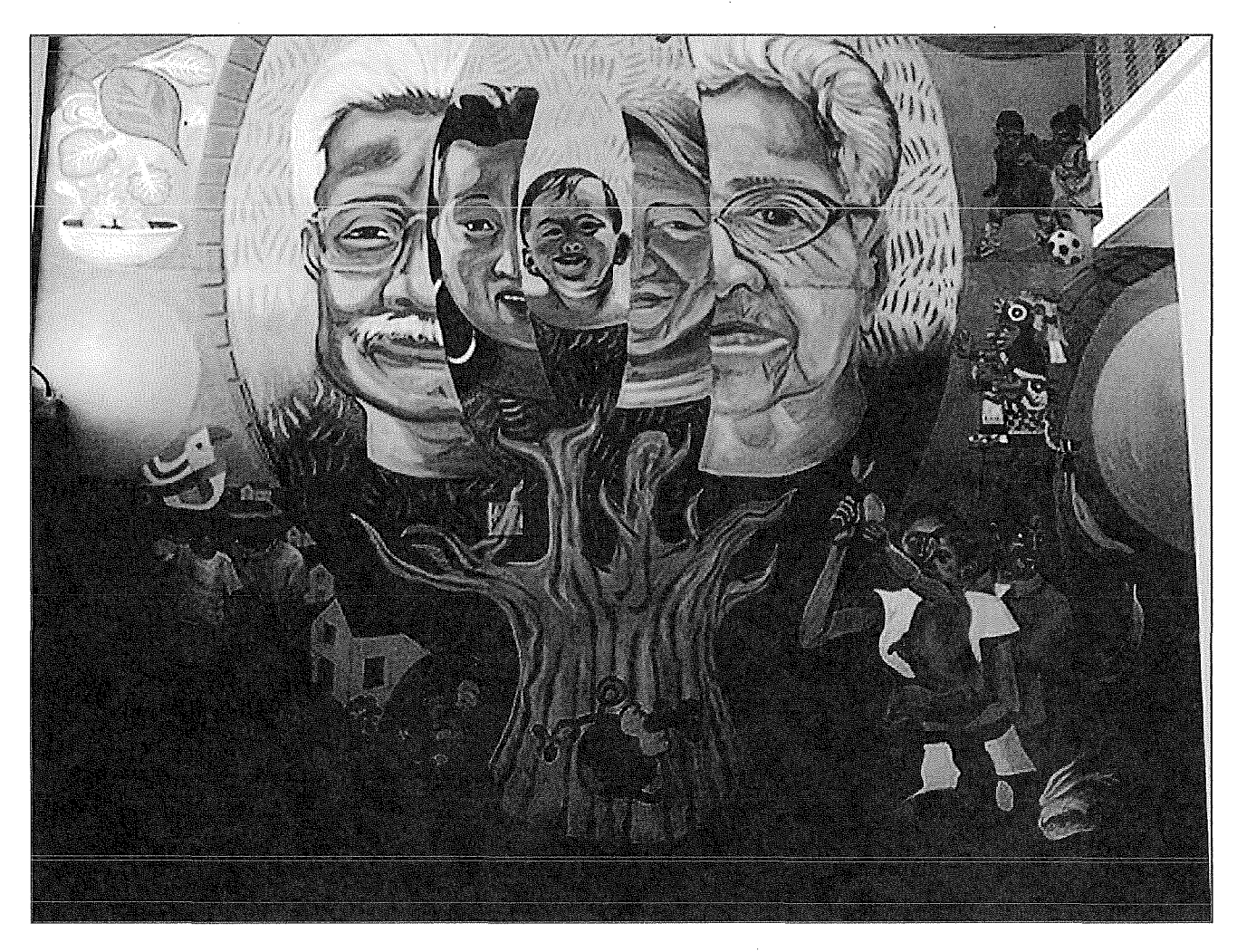
San Francisco mural in response to residents being asked about local health issues.

San Francisco Mental Health Services Act