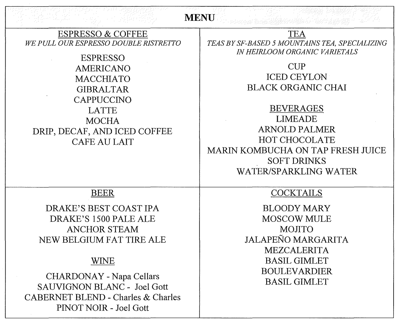
Exhibit B – Page 2 of 9