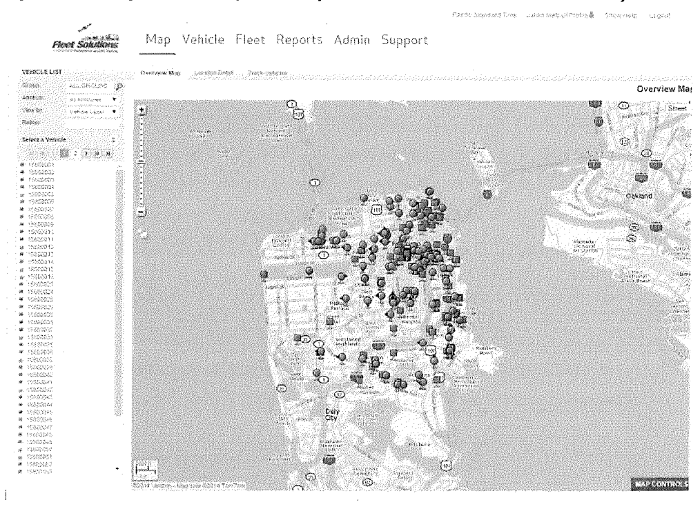
Figure 2: Managers can easily monitor potential unauthorized vehicle activity

The panel on the top in Figure 2 shows the real-time location within the City of all vehicles for which a particular manager is responsible. The panel on the bottom shows part of an alert message that would be sent to the manager reporting the real-time location of a vehicle not authorized to leave the City.