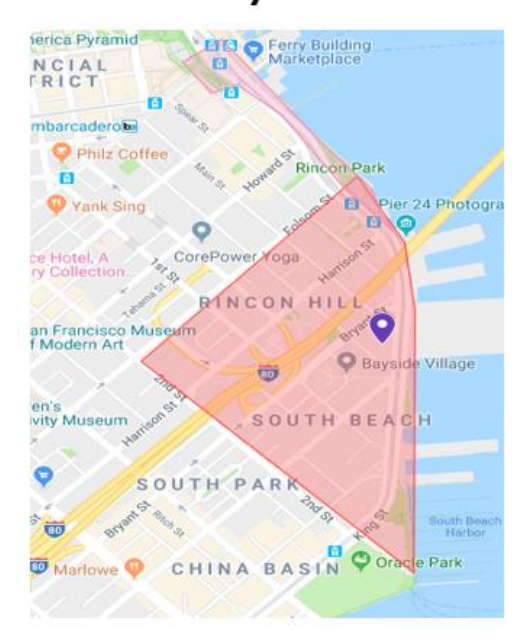
Figure 1: The Safety and Outreach Zones Safety Zone