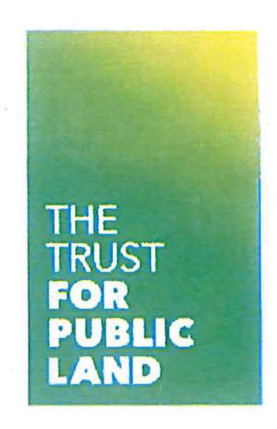
Exhibit F The Trust for Public Land Logo