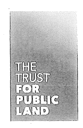
Exhibit F The Trust for Public Land Logo