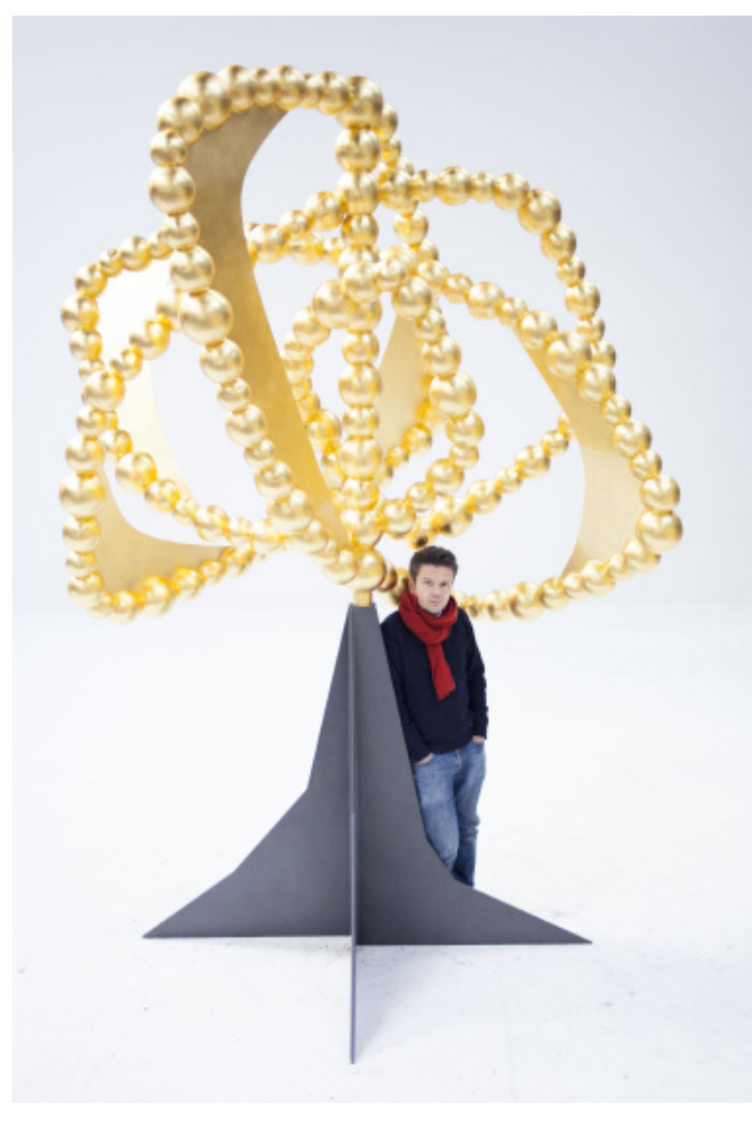
Jean-Michel Othoniel with La Rose des Vents, 2015.

Sep 2015: After a 5 months exhibition at the Isabella Stewart Gardner Museum in Boston, the artworks of «Secret Flower Sculptures» are staged in a double exhibition in San Francisco: at the 836m Gallery on Montgomery Street and in the Golden Gate Park, unveiling the artist's latest monumental sculptures inspired by flowers.