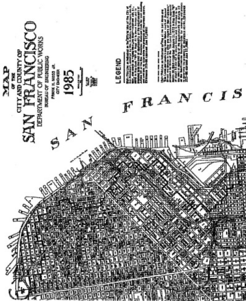
FIGURE 1A-I –1851 HIGH-TIDE LINE MAP

Standard Plan Review Hourly Rate - Minimum Four Hours