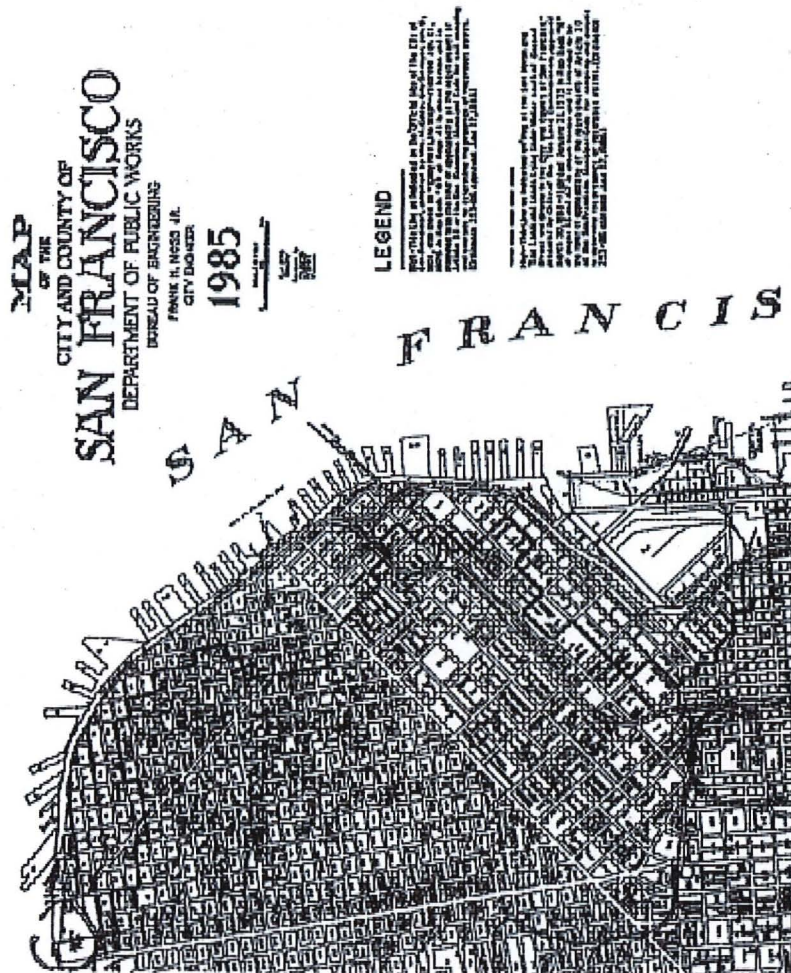
FIGURE 1A-I –1851 HIGH-TIDE LINE MAP

Standard Plan Review Hourly Rate - Minimum Four Hours