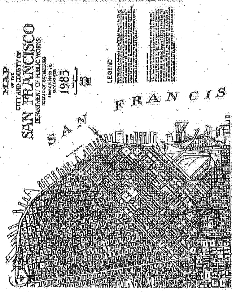
FIGURE 1A-I-1851 HIGH-TIDE LINE MAP

Standard Plan Review Hourly Rate -Minimum Two Hours Standard Plan Review Hourly Rate -Minimum Four Hours