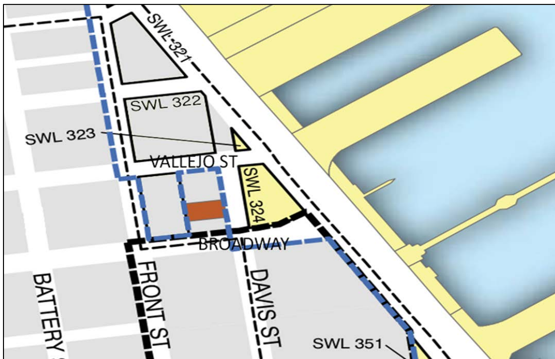
Exhibit 1: Map of Seawall Lots 323 & 324

On July 12, 2016 the Board of Supervisors approved a resolution endorsing the Port's Term Sheet with TZK Broadway, LLC (File 16-0541). Attachment 1 provides a summary of the changes to the project that are included in the proposed Ground Lease since the Term Sheet was approved by the Board of Supervisors in 2016.