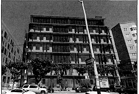
345 4<sup>th</sup> Street as proposed in the approved project application .