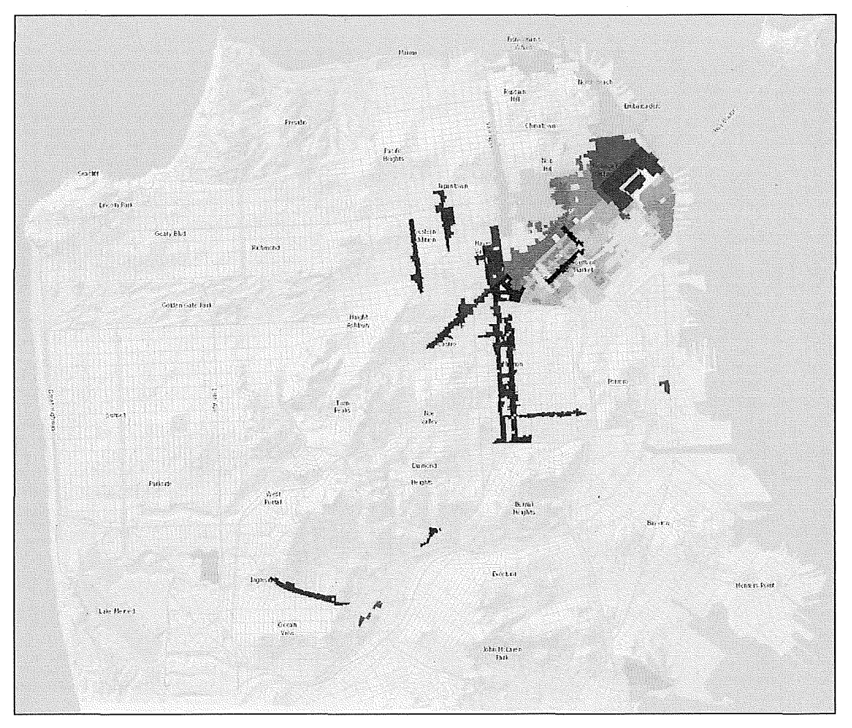
Fig. 1: Map highlighting zoning districts where the proposed TUA would be allowed.