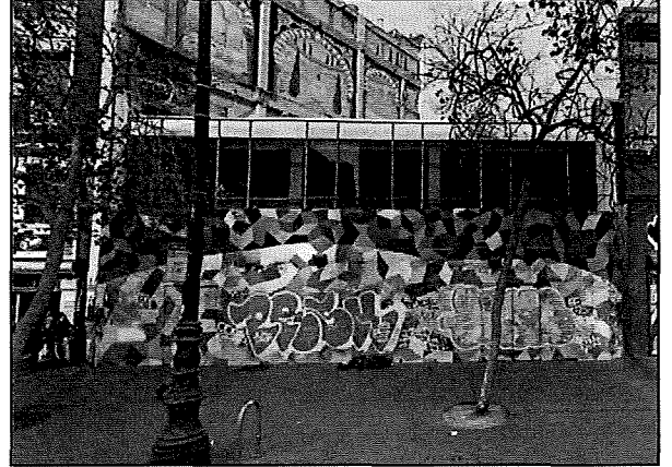
1066 Market Street in 2017. The site has been vacant since 2014.