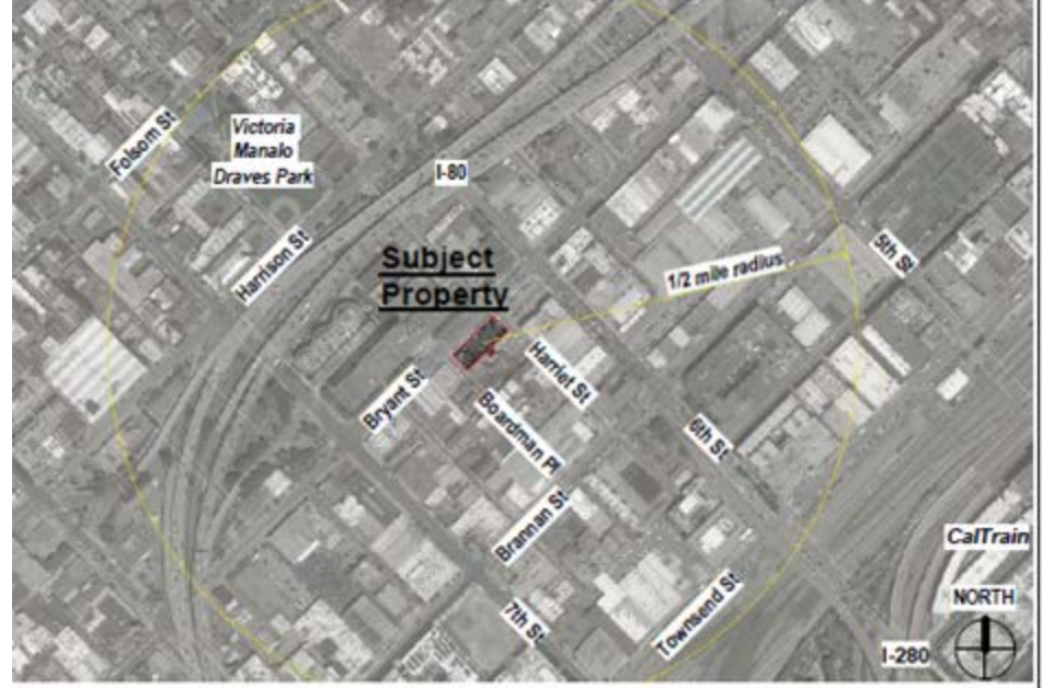
AERIAL VIEW & VICINITY MAP