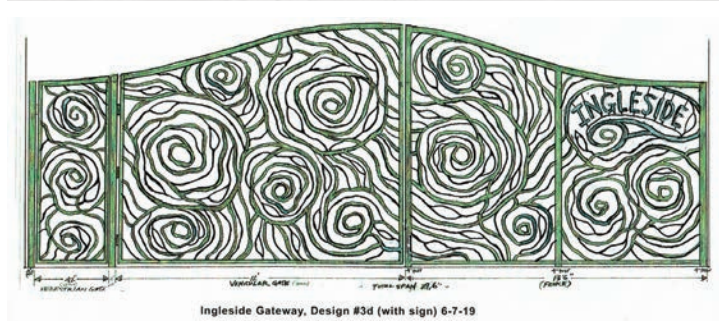
INGLESIDE LIBRARY GATEWAY OAA has contracted with sculptor Eric Powell to design and fabricate a bold gate for the entrance of the Ingleside Library garden. The grant-funded project is expected to be completed in the winter.