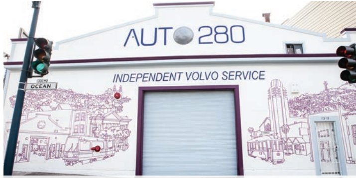
AUTO 280 MURAL Last year, OAA and SF Shines had a new mural designed and painted by San Francisco artist Amos Goldbaum on Auto 280.