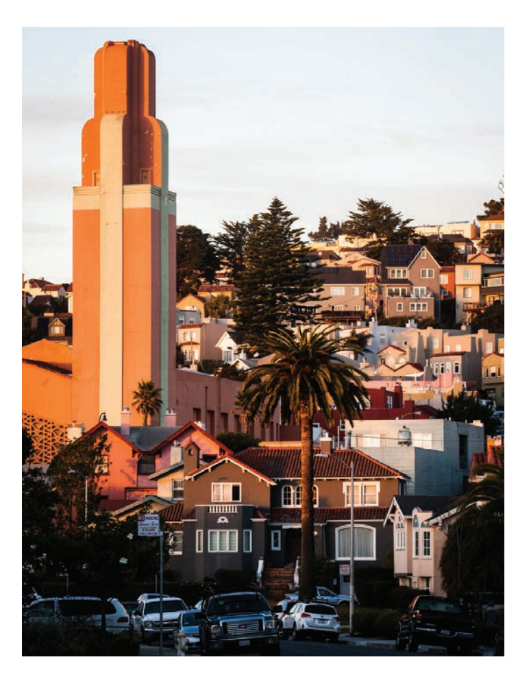
OAA is working to revitalize the former El Rey theater for the health of the corridor.

OAA continues to guide a multi-year effort to create a Historic Preservation Survey for Ocean Avenue. The survey identifies potential significant historic buildings on the corridor. Small buildings and storefronts allow for small business tenancy and contribute to the neighborhood's walkability and overall character. The survey can also be used in the future to designate a historic district on the corridor. After leading the charge to landmark the former El Rey theater, OAA engaged the owners about revitalizing the storefronts, facade, lobby, and auditorium. Rehabilitating this building would restore retail and