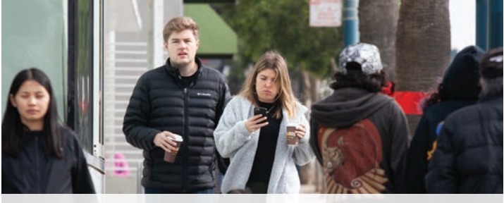
PUBLIC LIFE SURVEY OAA contracted Livable City to do a Public Life Survey to gauge the level of public amenities such as walkability, availability of gathering spaces, and business composition. It will be completed in the Fall of 2019.