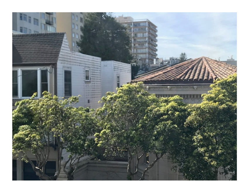
South Side windows completely shaded, partial solar shading