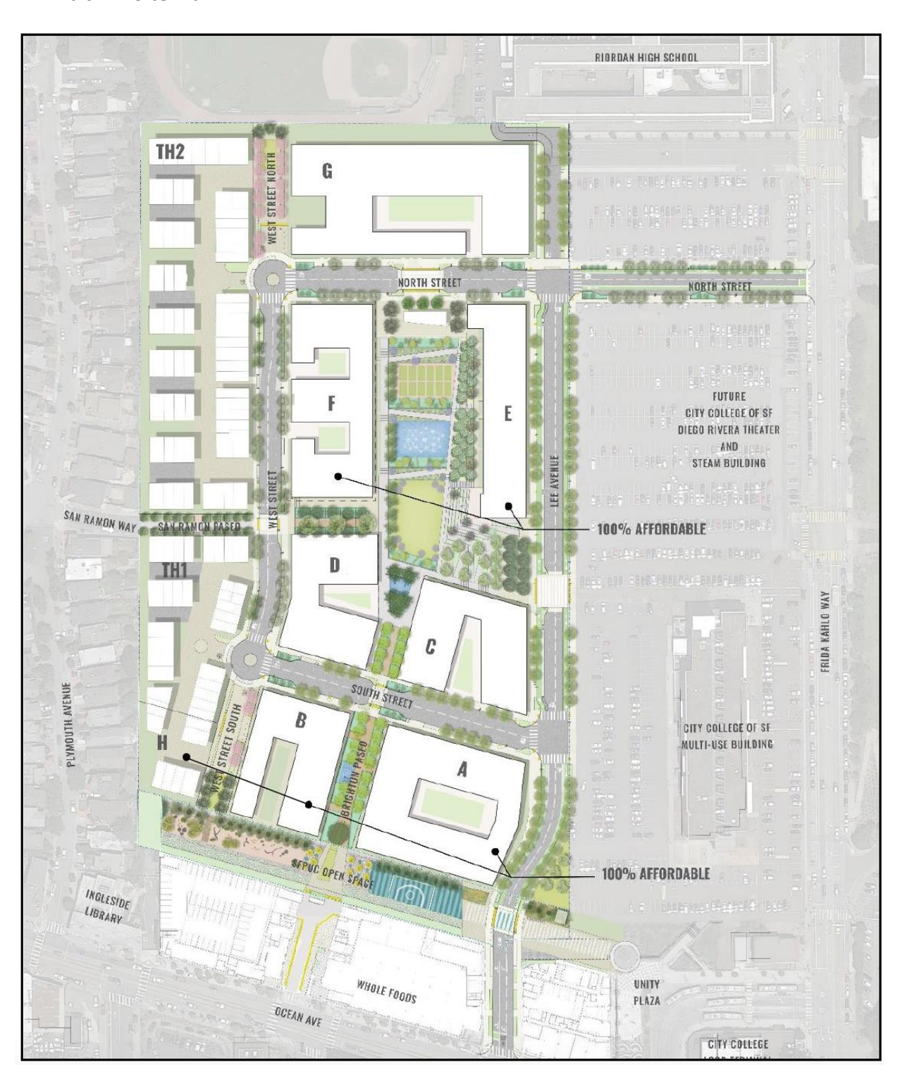
Exhibit A1: Site Plan