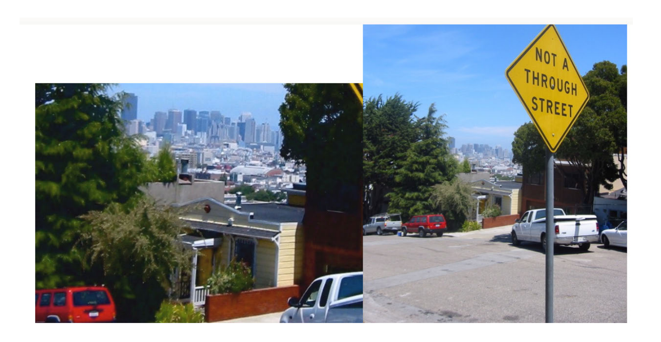
Current front photo of our house, 619 Sanchez Street, San Francisco CA 94114 after we added modest addition.