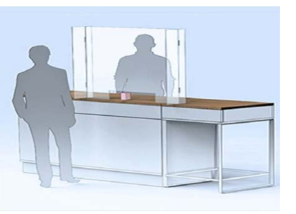
PLEXIGLASS BARRIERS Support social and physical distancing.